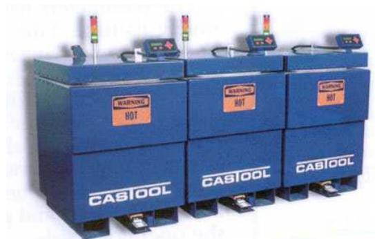
Figure 10-2: Single cell die heaters