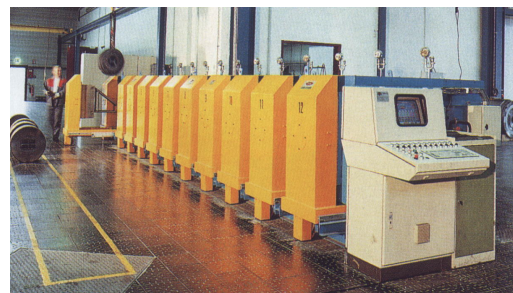
Figure 10-5: Inert Atmosphere-type die heater