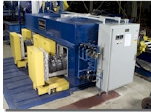
Figure 10-3: Drawer-type die heater

Infra-Red. The electric infrared heating system heats primarily by infrared radiation. Suppliers claim that this type oven offers fast, precise die heating, resulting in improved die performance at the press.