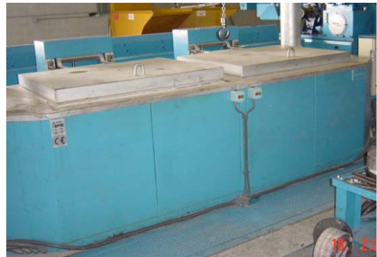
Figure 10-1: Box-type die heaters

When this type of oven is used, it is especially important to use some system for controlling the heating time of each die. Some extruders use a computerized system to track the time each die is placed into the oven and when it is removed.