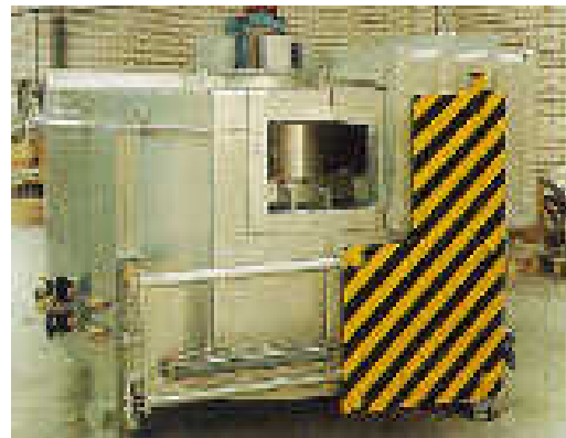
Figure 10-4: Rotary-type die heater